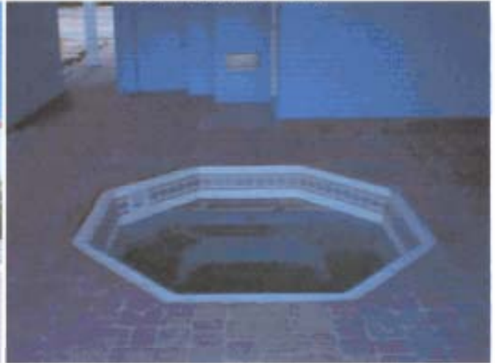
COVERED AREA W/ SPA