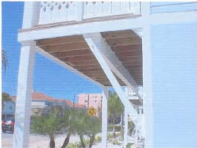
BACONY W/ CANTILEVER