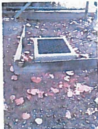
191 st Pond Before Repair

There were three repairs made, by Pubic Services staff under the direction of the Town Engineer, to Town owned and operated retention ponds located at 191 st Ave and the Nature Center pond during this reporting period. The pond on 191 st Ave. had accumulated material removed and properly disposed and a new skimmer device was installed. The Nature Center pond had erosion control materials installed at the end of the concrete flume and had obstructions removed from the discharge pipe in the seawall. Picture of these repairs are shown below: