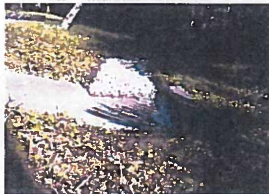
New Nature Park flume erosion control

All CDS units owned by the Town of Indian Shores were cleaned two times during this reporting period. This cleaning is performed on a twice per year cycle. The Indian Shores MS4 system is very small consisting of 17 storm infrastructure elements and 8 outfalls to the Intracoastal Waterway.