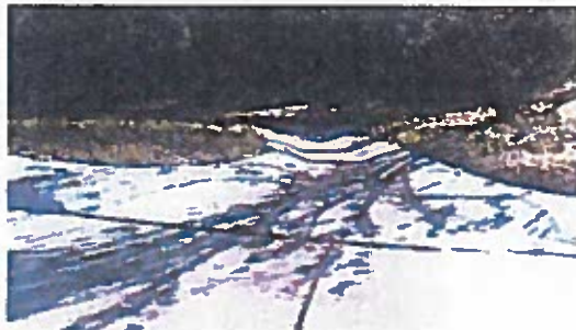
Nature Park concrete flume