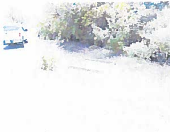
191 st Pond After Skimmer Repair and accumulated materials removed