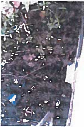
Nature Park pond outfall prior to cleaning