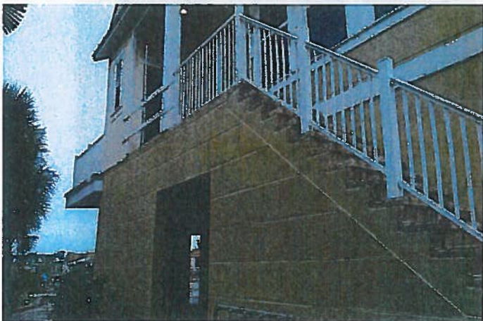
LEFT VIEW (01/13/16)