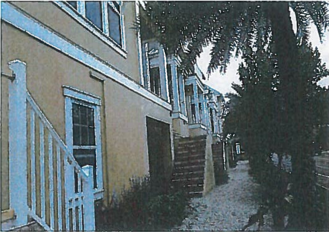
FRONT VIEW (01/13/16)

If using the Elevation Certificate to obtain NFIP flood insurance, affix at least 2 building photographs below according to the instructions for Item A6. Identify all photographs with date taken; "Front View" and "Rear View"; and, if required, "Right Side View" and "Left Side View." When applicable, photographs must show the foundation with representative examples of the flood openings or vents, as indicated in Section A8. If submitting more photographs than will fit on this page, use the Continuation Page.