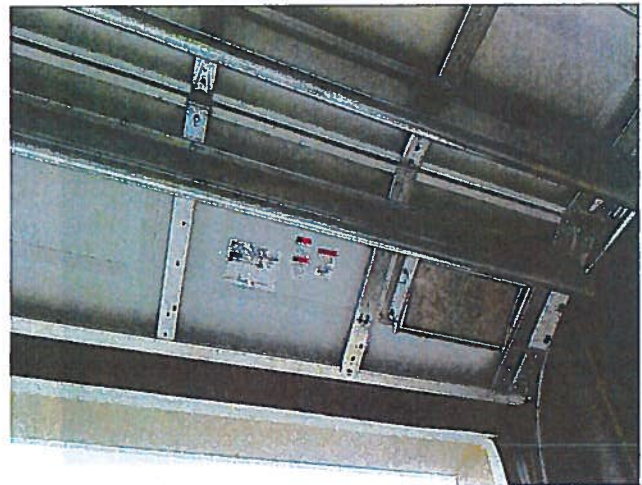
(REAR) GARAGE VIEW TYPICAL (01/13/16)