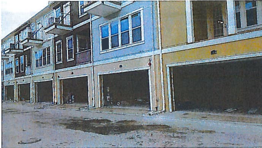
REAR VIEW (01/13/16)

If submitting more photographs than will fit on the preceding page, affix the additional photographs below. Identify all photographs with: date taken; "Front View" and "Rear View"; and, if required, "Right Side View" and "Left Side View." When applicable, photographs must show the foundation with representative examples of the flood openings or vents, as indicated in Section A8.