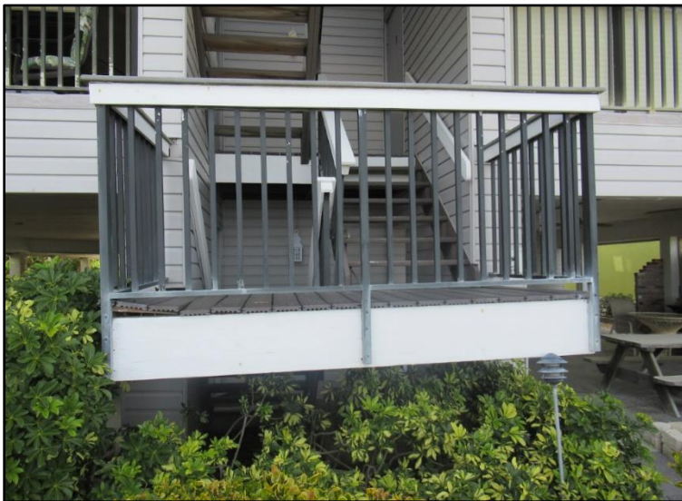
PHOTO 2: Observed sag to the northwest corner of the lower stair landing.

Immediate repair/replacement required. Please block off this stairwell to prevent injury.