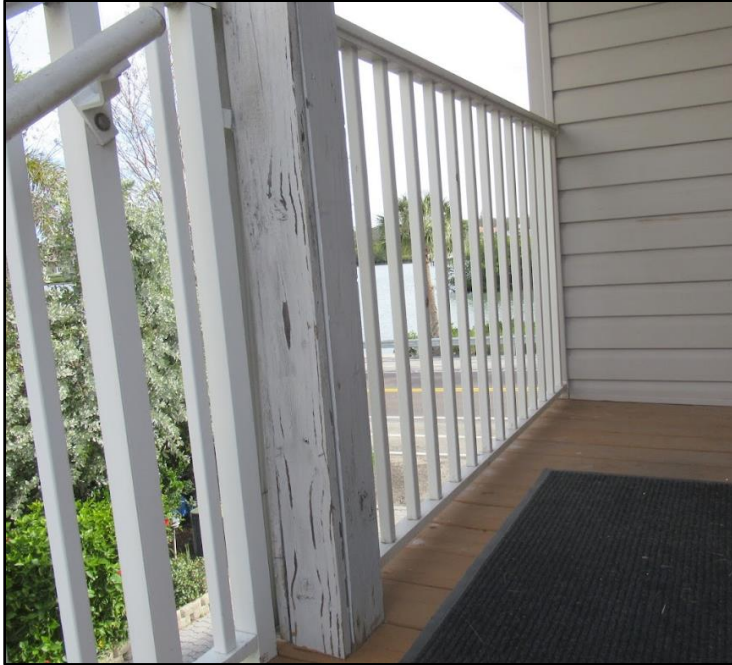
PHOTO 4: Observed the need for replacement to the rotten wood beam in the upper landing of the west stairwell.