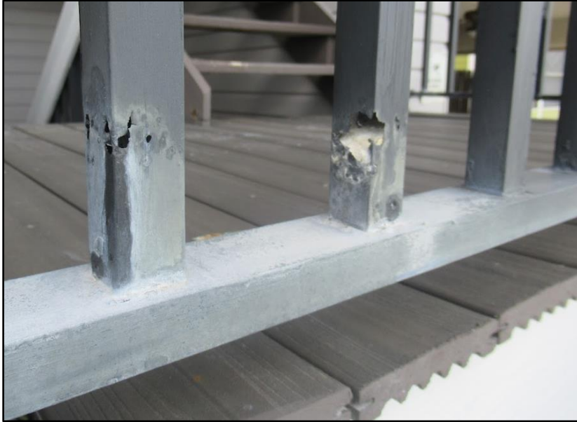
PHOTO 5: Observed the need to replace stairwell railing systems in the lower landing on the east stairwell. (Typical)

Immediate replacement required. Please block off this stairwell to prevent injury.