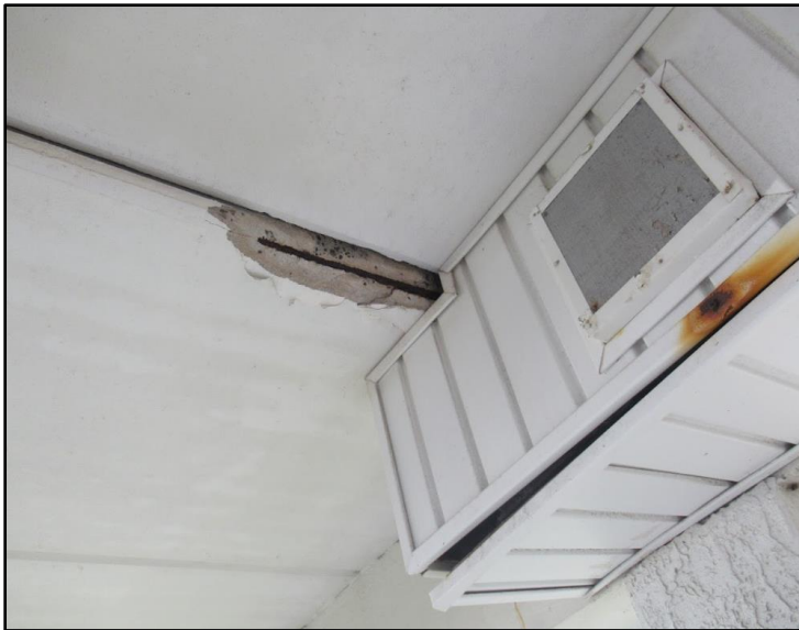
PHOTO 6: Observed the need for repairs to the spalling concrete perimeter beam in the covered parking garage. Located along both the NW and NE corners.