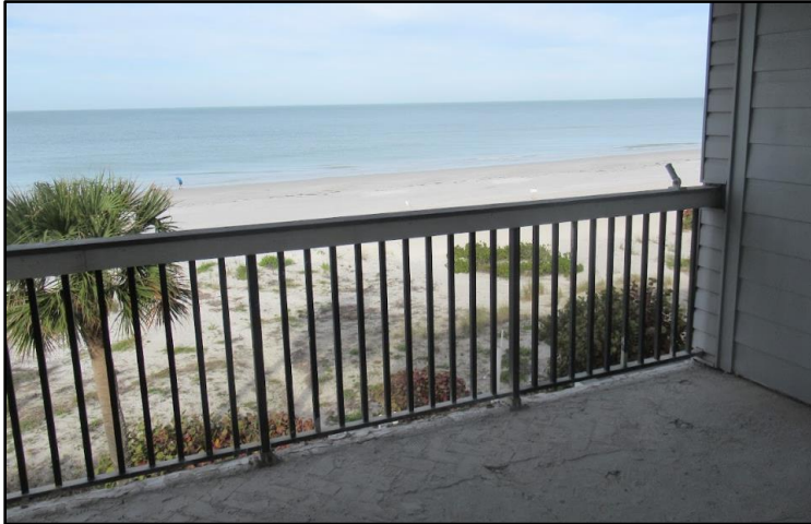
PHOTO 1: Observed the need to repair loose railings on Unit 4 balcony.