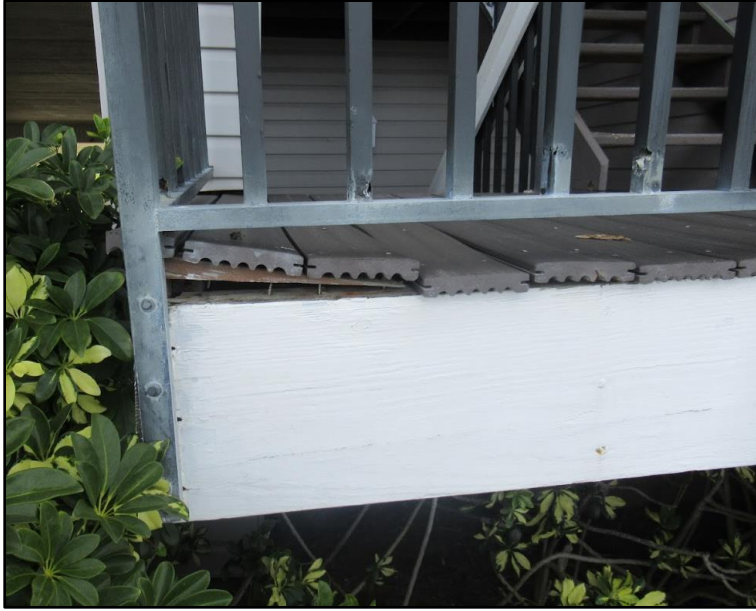
PHOTO 3: Observed sag to the northwest corner of the lower stair landing. (Close up of photo 2)

Immediate repair/replacement required. Please block off this stairwell to prevent injury.